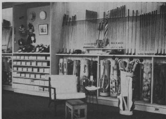
Revolta's shop has the new idea of space incorporated in it. You'll note that nothing looks overcrowded here.