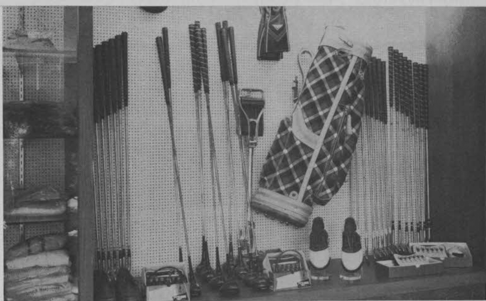
A sample of practically every type of playing equipment is concentrated in this corner which has a pegboard backdrop. Shoes and sport shirts also are found here.