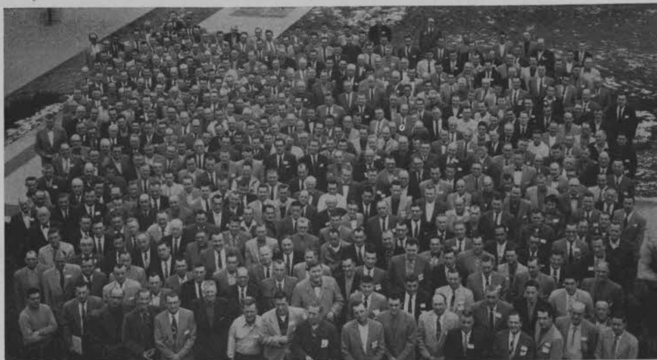
Part of the record delegation of superintendents at Midwest Purdue Meeting.