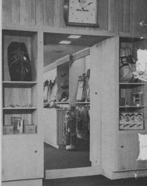
Recessed mirror, attractive shelving and panelling all help to give a beckoning look to the Evanston GC pro shop merchandise.