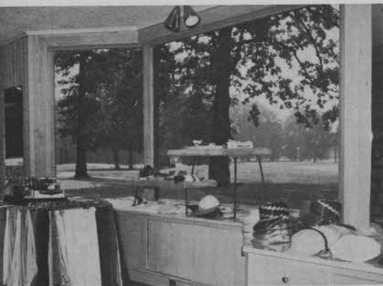
Sportswear dept. is in front of shop.

the spotlighting and concealed lighting fixtures at the top of the display frames in which clubs, bags, apparel and accessories are shown.