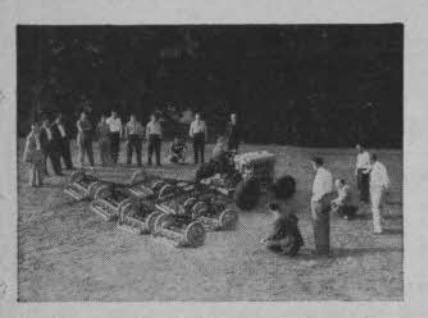
Excellent cutting efficiency and low maintenance cost makes these rugged Worthington Fairway Mowers the standard of comparison wherever a smooth, even-cut turf is required. Available in 3-, 5- and 7-gang units.

The hill-hugging Worthington, Model "G" Tractor, equipped with a hydraulic sickle bar, makes short work of hard-to-get-at hillside mowing. Used widely by highway departments for tough job mowing.