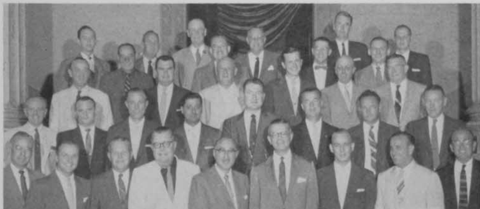
(Above) New products, Xmas sales were most discussed topics when MacGregor sales staff assembled in Cincinnati in August for annual meeting.