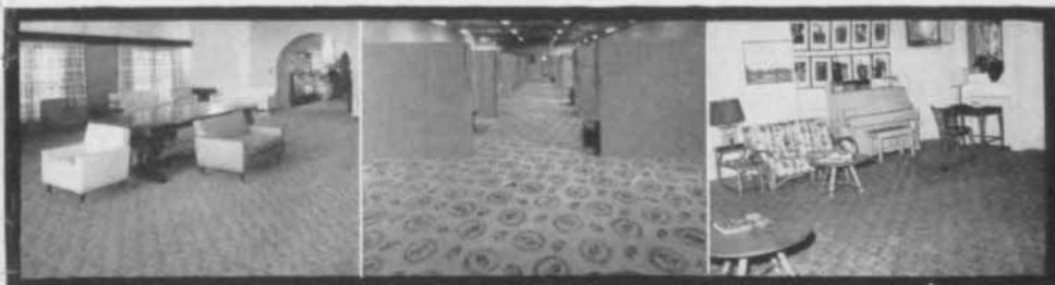
GRIFFITH PARK GOLF CLUB LOS ANGELES, CAL.

New "Golf Club" Herald shows what it is doing for clubs everywhere!