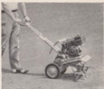
AERATING? Put the Toro Power Handle to work on the Aerator unit. Power Handle works year-round.