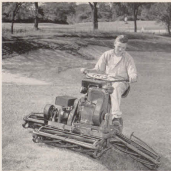
UNEVEN GROUND? Hinged "wing" reels of the 76-inch Toro Professional hug ground contours.