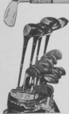
Oval or Round Type Bags

Par Tube Protects Your Grips The Full Bag Length