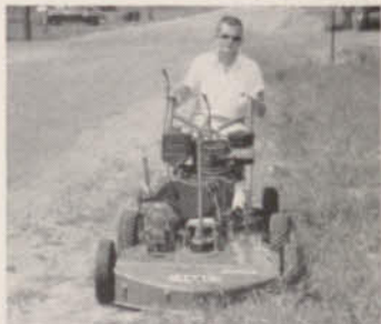
ROUGH AREAS? Spin through grass or tangled growth with the 31-inch Toro Whirlwind. Sulky optional.