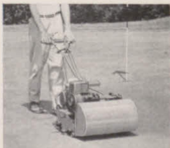
GREENS? 21-inch Toro Power Greensmower cuts closer, throws more clippings into the grass box.