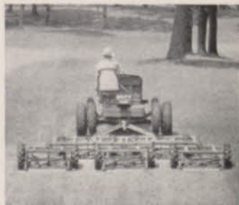
FAIRWAYS? Five-unit Toro Roughmaster (shown with Toro Bullet Tractor) mows a swath 13 ft. wide.