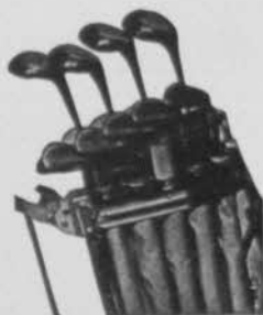
PAR TUBES As Used in Individual Compartment or Slot Type Bags