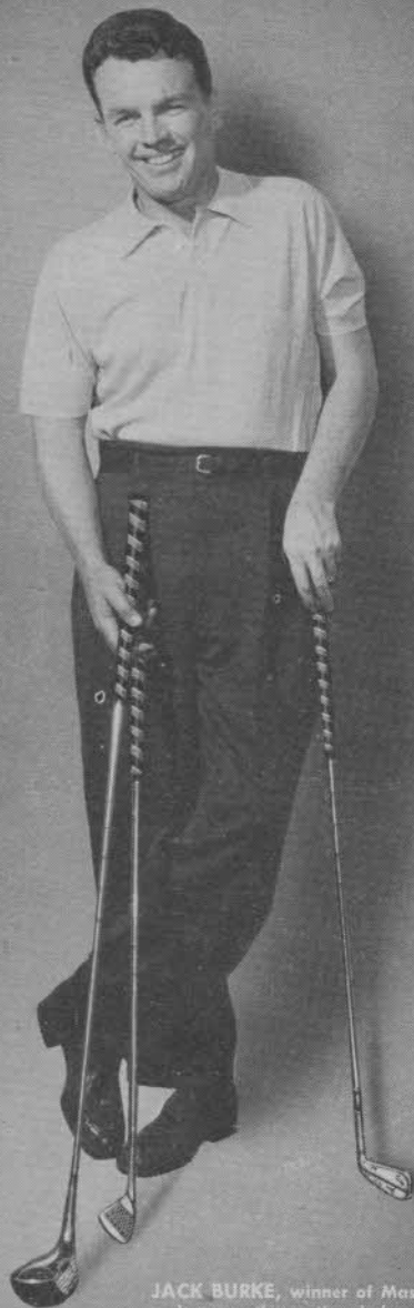
JACK BURKE, winner of Masters, PGA, and many other national championships.

MacGregor Tourney Woods and Irons are Winners