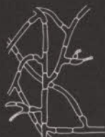
DOLLAR SPOT SCLEROTINIA homoeocarpa