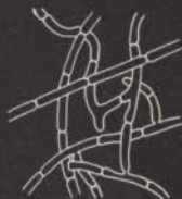
RED THREAD CORTICIUM fuciforme