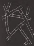
BROWN PATCH RHIZOCTONIA solani

DRAWINGS OF FUNGI AS THEY APPEAR IN THE NEW TURF DISEASE HANDBOOK