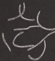
COPPER SPOT GLOEOCERCOSPORA sorgi