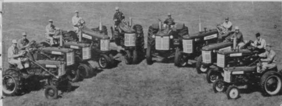
350 Utility, described above, is third from the right in this lineup of 1957 International tractors.

now available with Diesel, gasoline, LP Gas, or distillate engine, is available with regular or heavy-duty heavy front axle. The 350 can be equipped with power steering, independent power take off, or torque amplifier drive for reducing speed and boosting pull power on the go. It can be ordered with or without the regular Hydra-Touch hydraulic system with one, two, or three valves, or it can be had with a