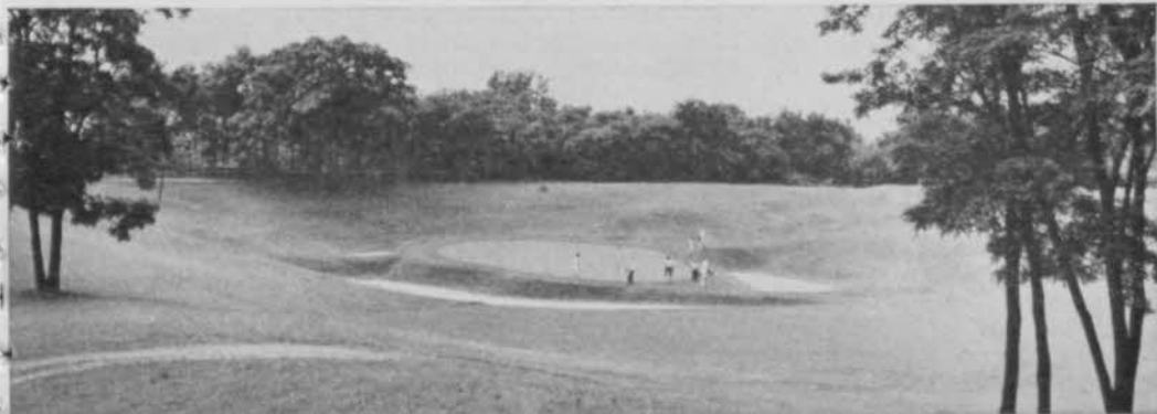
• View of a fairway and one of the beautifully maintained greens at Moraine Country Club.

DU PONT AMMATE ® X for brush and weed control ... Use Du Pont "Ammate" X for control of undesirable brush and poison ivy. It kills both foliage and roots, prevents regrowth. "Ammate" X is non-volatile, reduces to a minimum the hazard of damage by spray drift.