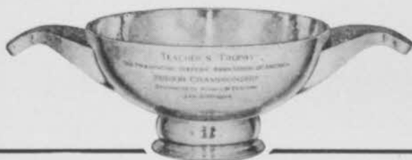
The Teacher's Trophy