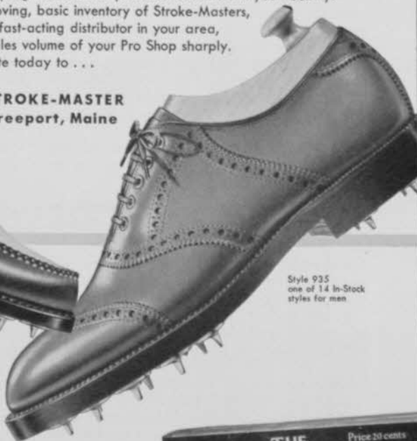
Style 935 one of 14 In-Stock styles for men