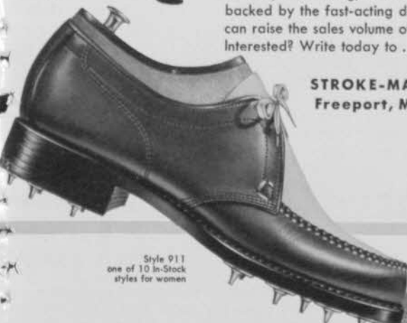
Style 911 one of 10 In-Stock styles for women