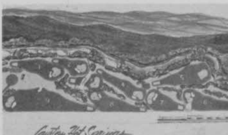
Lawton Springs Country Club