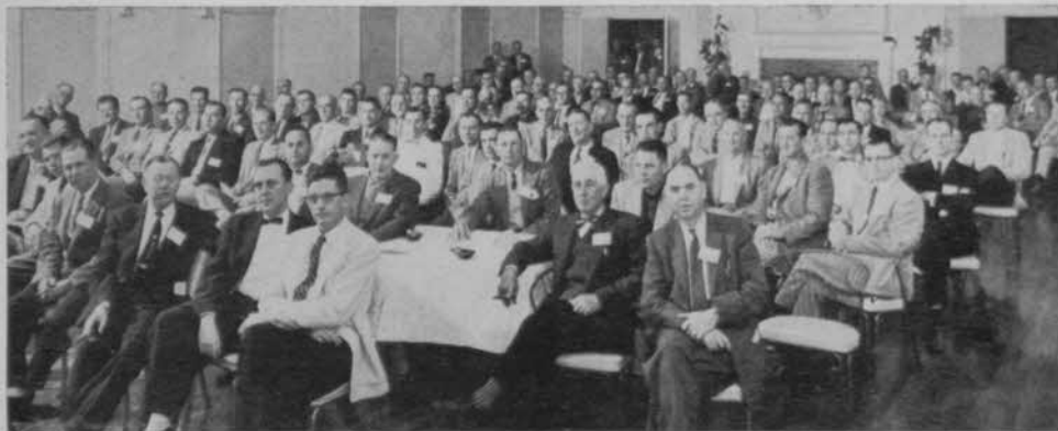
Opening day session at the Southern Association's two-day turf clinic.

All records for attendance at the Southern Turfgrass Association's annual two-day clinics were completely shattered this year when 136 supts. registered for the conference held at the Colonial CC, Memphis, Feb. 25-26. Sponsors of the event thought they had reached the ultimate two years ago when 103 persons attended the sessions.