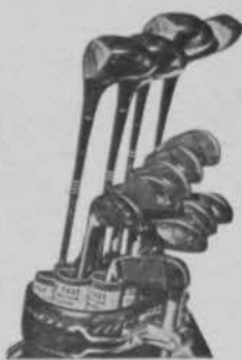
Oval or Round Type Bags