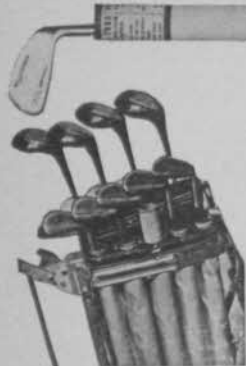
PAR TUBES As Used in Individual Compartment or Slot Type Bags

Par Tube Protects Your Grips The Full Bag Length