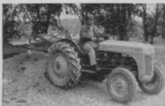
SPREADS TOP SOIL