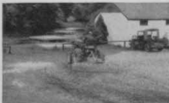
MAINTAINS PARKING AREAS