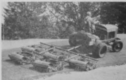
IREM TEMPLE C.C. DALLAS, PENNA.

ROSEMAN MOWER CORPORATION EVANSTON, ILLINOIS, U.S.A.