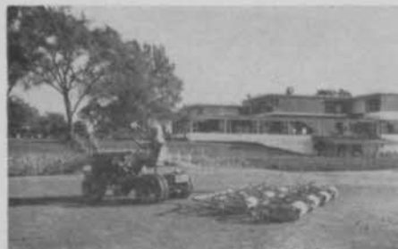
TAM O'SHANER C.C. NILES, ILL.