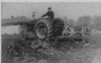
REVERSES FOR BULLDOZING