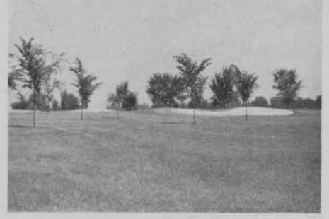
FLINT GOLF CLUB, FLINT, MICHIGAN

The architectural columnar form with its upright limb structure means: no winter or storm damage — Lawns grow right up to the base of the trunk — The narrow but deep root system has no surface roots to interfere with other plantings or with lawns and lawn care — The large dark green leaves tend to fall in a small area and in a short space of time and there are no seeds to create a mess.