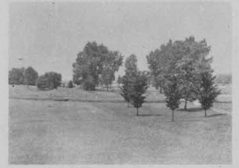
RIVER FOREST G. C., ELMHURST, ILL.

LEADING Golf Courses in 20 states have found that AUGUSTINE ASCENDING ELMS are a most attractive, formed, tree for planting near greens. They are also used to screen parking areas, line drives, define fairways, and emphasize the beauty of golf course landscape in dramatic groups or rows.