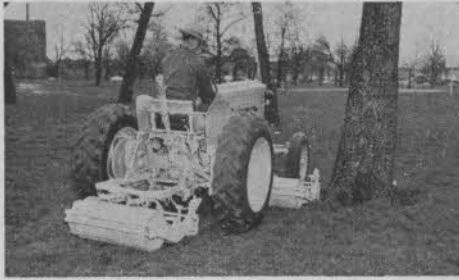
John Deere "420" Utility with Gang Mower.

A direction reverser that permits forward or reverse travel at the same speed without shifting is the highlight of several new optional