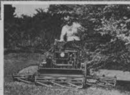
Cutting around overhanging shrubbery is easy with Riding Sulky attached.