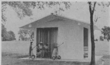
One of Armco steel shelters at Middletown's Wildwood course

Armco Drainage & Metal Products, Middletown, O., recently tested its new steel golf shelter at Westinghouse Electric Corp's high voltage lab with excellent results. Special lab equipment generated repeated surges of 3-