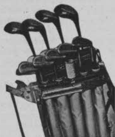
PAR TUBES As Used in Individual Compartment or Slot Type Bags

The demand is terrific and the profits are quick. PAR TUBES superior construction proves them tops in the field. A Must for any golfer who wants to protect his grips the full bag length and obtain a friction-proof bag with an individual compartment for each club. PAR TUBES are dropped into oval or round type bags allowing a numerical arrangement of clubs. PAR TUBES fit into and strengthen individual compartment bags, allowing full free use of EVERY compartment.