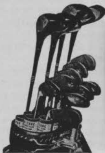
Oval or Round Type Bags

PAR TUBE— 5710 W. DAKIN ST., CHICAGO 34, ILLINOIS