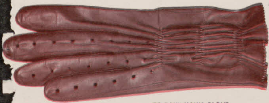
B2 PAUL HAHN GLOVE