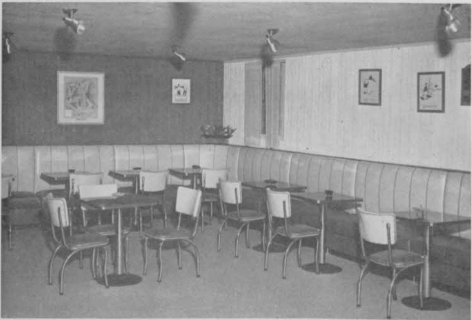
"Your home away from home" is keynote of 19th hole at Andrews. GI's gather here to replay their golf games, make plans for the next round. Bar, where soft drinks and sandwiches are served, is at opposite side of the room, and just beyond a doorway, adjacent to the bar, is handicap board.

With only a nine hole course, we have been plagued by overcrowding as long as I've been here. At times, this can be very disconcerting, but, at least, I can see a