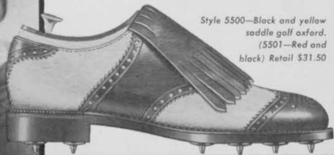
Style 5500—Black and yellow saddle golf oxford. (5501—Red and black) Retail $31.50

Foot-Joy Shoes are truly the finest of their kind. Stock up now — be ready for big profits on America's most wanted shoe!