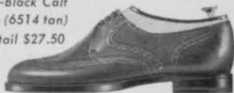
Style 6515—Black Calf 3 eyelet tie (6514 tan) Retail $27.50

WATCH FOR OUR NEW FULL-COLOR NATIONAL ADVERTISING CAMPAIGN — IT'S A KNOCK-OUT!