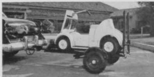
CUSTOM ENGINEERED TRAILER $189.00, F.O.B. Los Angeles, complete except hitch, or will furnish blueprint and specification free with purchase of Golf Pony.

ELECTRIC VEHICLE DIVISION McCULLOCH MOTORS CORPORATION 4625 Alger Street • Los Angeles 39, California