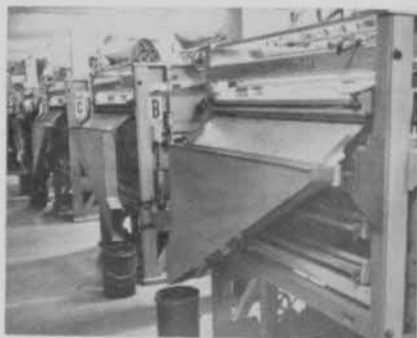
. . . to world's largest seed cleaners.

Another important feature of the new plant is a complex air changing system that keeps the Scott product practically dust-free. In recent months, Scott & Sons has added 15 acres to already extensive research lawns, adjoining the plant, to carry out even more exhaustive performance tests than it has in the past.