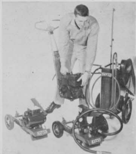
Toro's "Hurricane Package" consists of generator (left), pump (center) and lawn sprayer.

Toro Mfg. Corp., Minneapolis, Minn. has unveiled three more units for its Power Handle. These include a generator (a "hurricane package") and a lawn sprayer, bringing to eight the number of components that can be fitted to Toro's Power Handle, a basic source