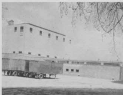
Everything's new from elevator . . . .

O. M. Scott & Sons Co's new plant in Marysville, O. has been specifically designed to aid the company in control of grass seed quality from the grower to the consumer. Third and fourth floors of the five-story elevator portion of the plant are occupied by more than 100 bins, each with 15,000 lbs. capacity, for bulk seed storage. Eighteen elevators are operated to charge the bins directly from a railroad siding.