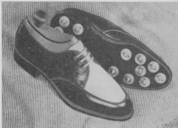
Style #954 *

Style #375 *. Blucher Saddle Oxford. Welt constructed of finest quality heavy Veal for ruggedness; single sole for lightness. The ideal every day golf shoe. Phillips replaceable spikes. Antiqued Brown only.