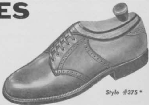
Style #375 *

Style #375 *. Blucher Saddle Oxford. Welt constructed of finest quality heavy Veal for ruggedness; single sole for lightness. The ideal every day golf shoe. Phillips replaceable spikes. Antiqued Brown only.