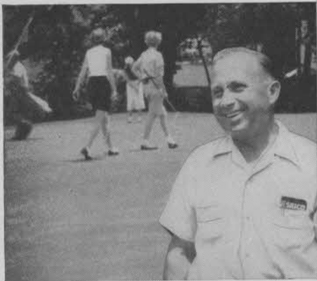
One of the beautiful greens at Essex County Country Club, West Orange, N. J.