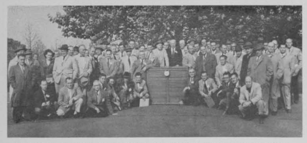
West Point Products distributors get together at annual school for service to superintendents,