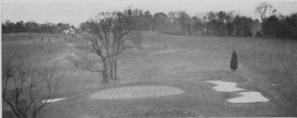
On all chemicals follow label instructions and warnings carefully.

"Tersan" and new "Semesan" Turf Fungicide are packaged for easy mixing and measuring. Both are compatible with most commonly used turf chemicals and pesticides. To save time and labor, fertilize when you spray for disease. Just mix in Du Pont Soluble Plant Food. It's packed in 50-lb. bags, especially for golf-course use.