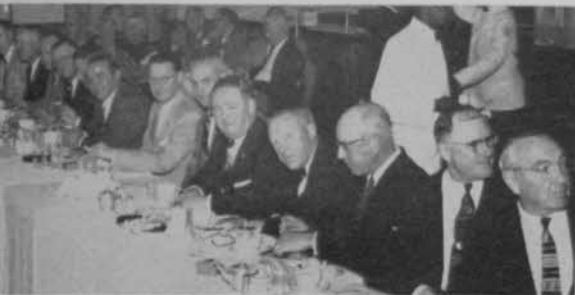
Two views of the U. S. Rubber Co.'s big pro gathering at Seniors' Week dinner (above) and the speakers' table (below).