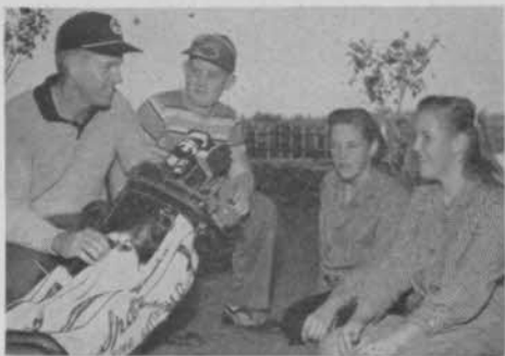
Gene Littler, erstwhile San Diego junior, returns as a big-time tournament golfer to give tips to the city's budding stars.