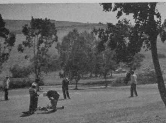
San Diego CC, busy in the van of the big revival that is restoring the area as a golf center.

SAN Diego, Calif., one of the pioneer golf centers of the Pacific Coast, is staging a golf revival after a long lull. Grass is growing on new built courses; golfers are digging divots on newly opened fairways and other layouts are on the drafting boards as San Diego moves to end its serious shortage of golf facilities.