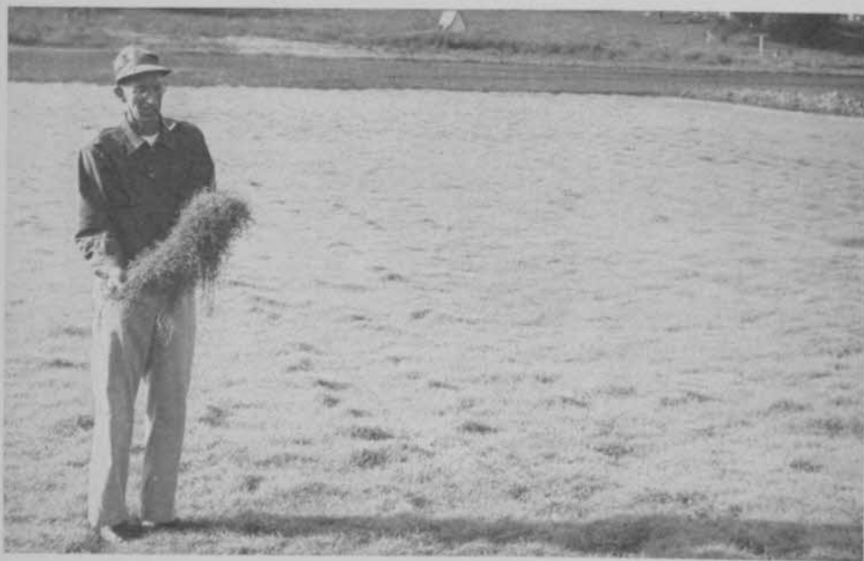
Long runner stolons, according to Lyons, will produce twice as much turf as the cropped variety. They also ship better and can be stored longer.