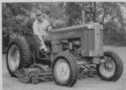
New John Deere "420" Utility Tractor with three-gang, pickup-type fairway mower, one of many matching tools available.

ture you will really appreciate. Tractor is the new, super-powered John Deere "420" Utility . . . sure-footed and stable on hillsides . . . low in initial cost, operating costs, and upkeep . . . easy to drive . . . maneuverable . . . and comfortable to ride. "Live" Touch-o-matic hydraulic power and standard 3-point hitch are regular equipment. Investigate now. There is a John Deere dealer near you.