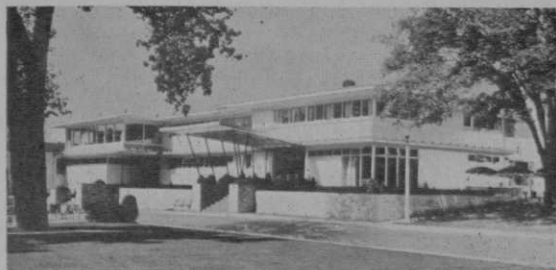
Tam o' Shanter Country Club Niles, Illinois

Fine clubs like these are always in great demand