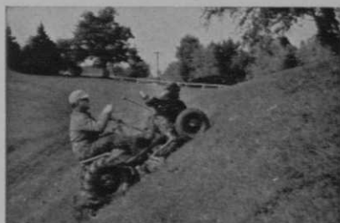
UP THE STEEPER HILLS