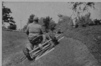
LOW CENTER OF GRAVITY—HERE IS AN 83% (40°) SLOPE—HERETOFORE CONSID- ERED IMPOSSIBLE.