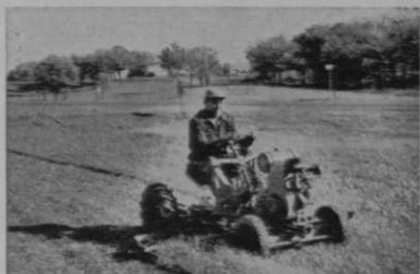
CUTS HEAVIER GRASS