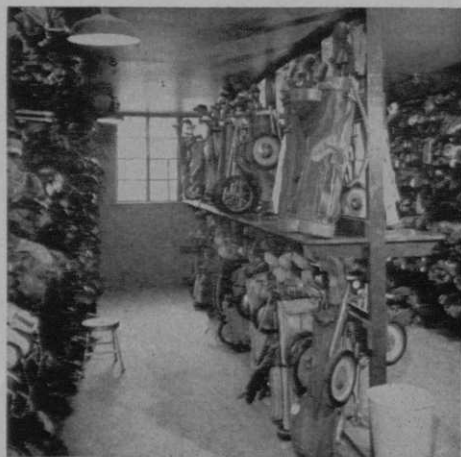
This compact arrangement in Cascade Hills pro shop keeps new lockerroom looking neat, instead of having carts piled on top of lockers.

"The rest of the racks are steel and we added enough more to take care of all the members bags. You might be interested to know that I got these from the General Steel Products Corp., Flushing, N. Y. which I found through an ad in Golfdom .