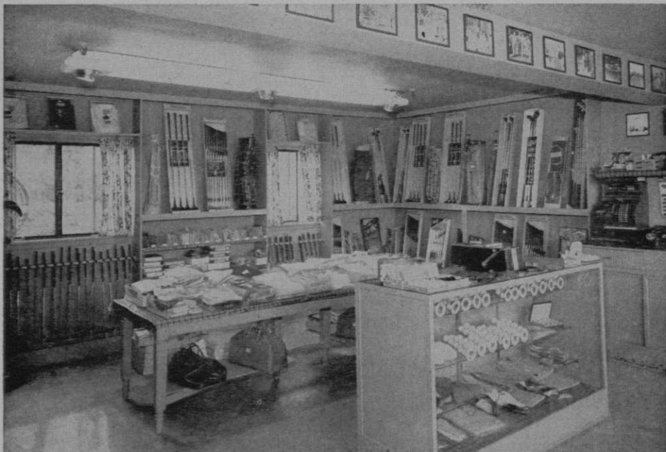
"Easy to get at" is the key of all display of merchandise in the Cascade Hills shop. Note that the cash register and ball display is located to give golfers a chance to be exposed to other items in the shop.

volume with them. Most of my business is done on a charge account basis but there are a certain amount of cash sales which are recorded on the cash register which also is handy to have in making change for the members.