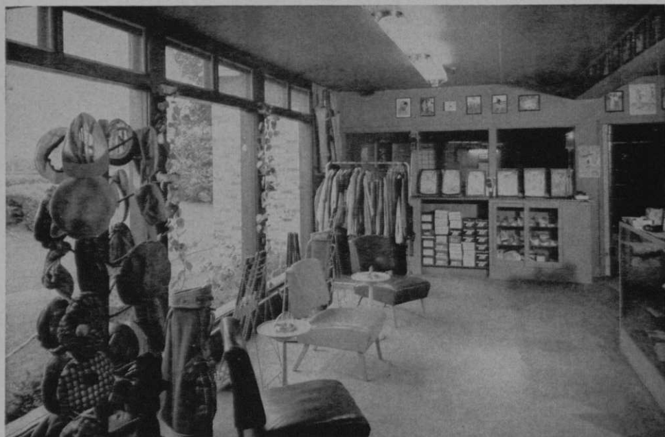
Light, and the beauty of the course as part of the picture, adds to the spirit of cheerfulness in the shop. Note club display at windows to be seen by passers-by.