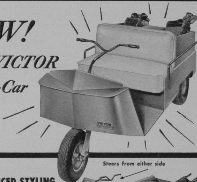
Steers from either side

MOST ADVANCED STYLING, MORE GOLFERS' FEATURES, BEST ENGINEERED GOLF CAR IN THE MARKET!