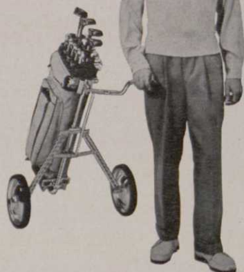
Above — Model T11PO with 11 inch disc wheels and P.O. bracket to set bag edgewise.