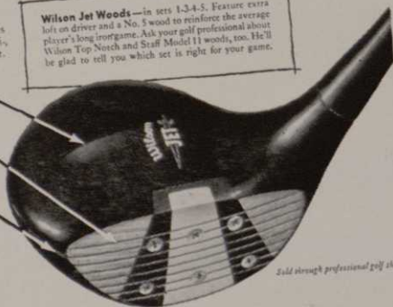
Sold through professional golf shops

Wilson Jet Woods —in sets 1-3-4-5. Feature extra loft on driver and a No. 5 wood to reinforce the average player's long iron game. Ask your golf professional about Wilson Top Notch and Staff Model 11 woods, too. He'll be glad to tell you which set is right for your game.