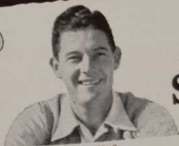
Cary Middlecoff Member of Wilson Advisory Staff