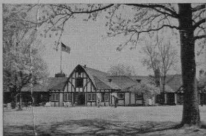
Sunset Ridge Country Club Winnetka, Illinois

Fine clubs like these are always in great demand