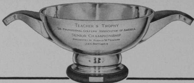
The Teacher's Trophy