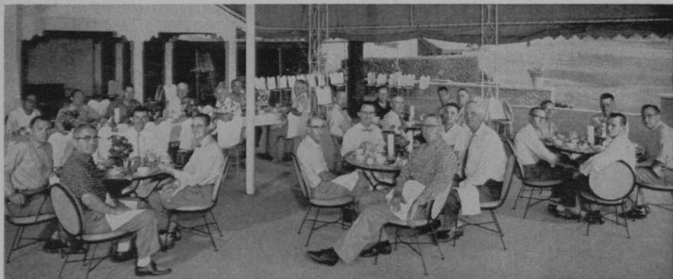
This meeting of Miami Valley Golf Course Superintendents' Assn. at the Moraine Country Club, Dayton, O., is typical of the many gatherings in the summer where superintendents work on course maintenance problems and compare notes with the host supt. and their other colleagues.