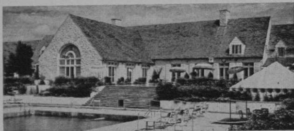
Southern Hills Country Club Tulsa, Oklahoma

Fine clubs like these are always in great demand