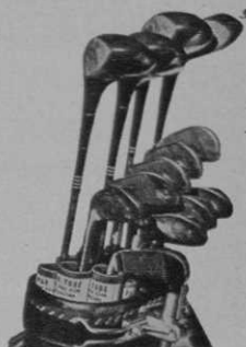
Oval or Round Type Bags

PAR TUBE— 5710 W. DAKIN ST., CHICAGO 34, ILLINOIS