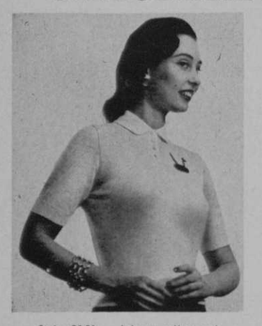
Style 2191 — Johnny collar and pearl buttons set off the golf stick and flag emblem. Nylon and vicara texture simulates finest grade of cashmere. In white, pink, blue, maize, navy and mint. Sizes 32 thru 40

In our "Sweater Surprises" of 1955 you'll find the 10 smartest custom styles of the season. Look to Chesterfield for quality that builds pro prestige—backed by a policy that protects it.—