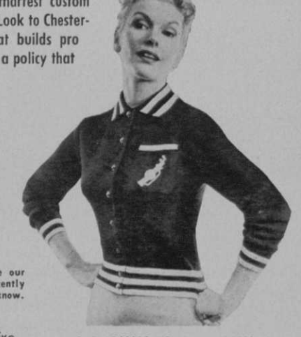
Style 2001LS—Cardigan, 100% imported virgin wool. Johnny collar, hand embroidered golf emblem on pocket and gold buttons. White & navy and navy & white. Sizes 34 to 40. Short sleeve and long sleeve.