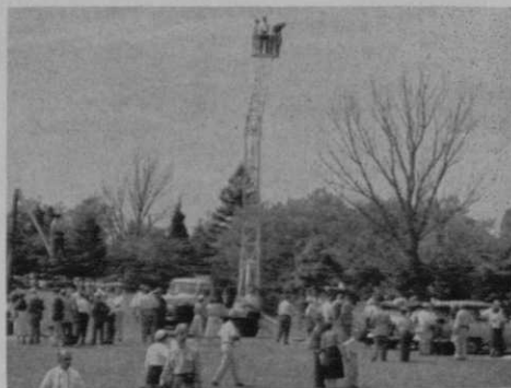
National Shade Tree conference at Atlantic City (N. J.) CC outdoor demonstrations feature new equipment for tree care. Among new devices is the tower making work easier and better high in the trees.