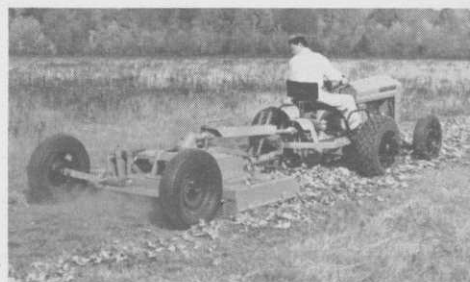
The Worthington 72" Power-Take-Off Rotary with a leaf-mulching attachment.

One of the outstanding features of the "72", which can be used with a Worthington Model "G" Tractor or with any two-plow tractor with power-take-off drive, is the arrangement of the cutting blades. They