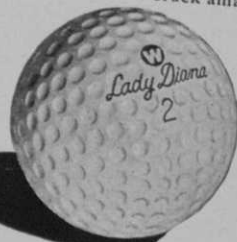
For women NEW LADY DIANA

For championship distance! Super-charged power center—exclusive dyna-tension winding insures uniform high compression. An established favorite with hard-hitting pros and crack amateurs!