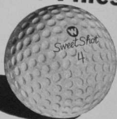
Golden Anniversary SWEET SHOT

For championship distance! Super-charged power center—exclusive dyna-tension winding insures uniform high compression. An established favorite with hard-hitting pros and crack amateurs!