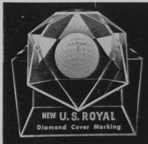
Pro Shop "Jewel" Display for New U. S. Diamond Ball.

The new ball, according to Sproul, will give more distance regardless of weather and against or with the wind. It also looks whiter, stays whiter in play and washes up