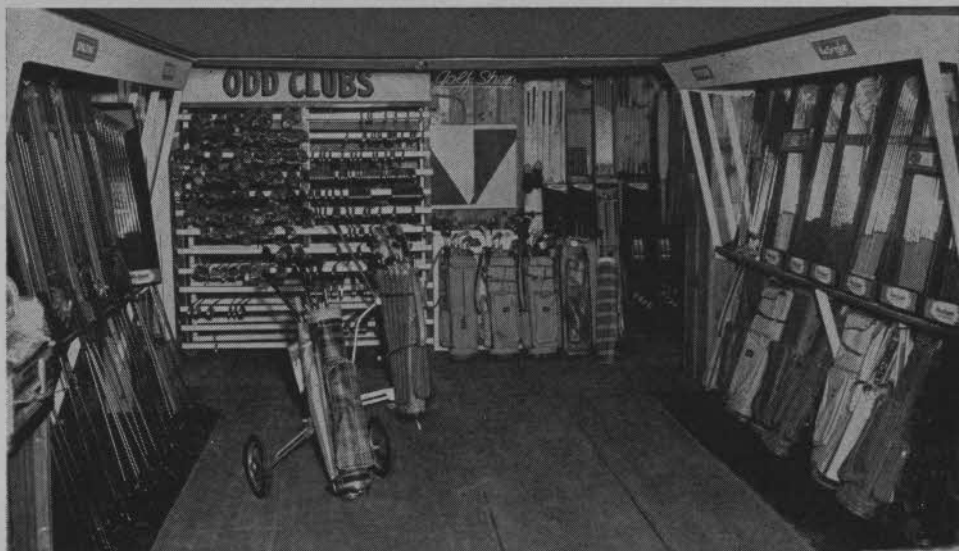
The "Odd Clubs" rack in one wing of McDonald's shop does large volume in new clubs and gets many beginners started in buying their own clubs at low prices.

publicity that good management can afford. He's also strong for promotion stunts.