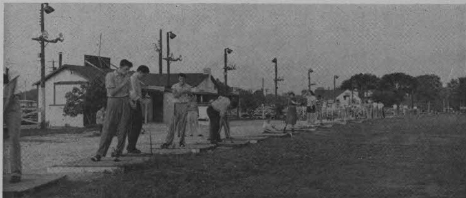
This partial view of the McDonald range was taken at 10 a.m., showing that a lot of morning business can be developed instead of crowding traffic into evening hours.