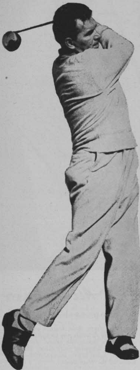
U. S. Open Champion Julius Boros— every man's opponent