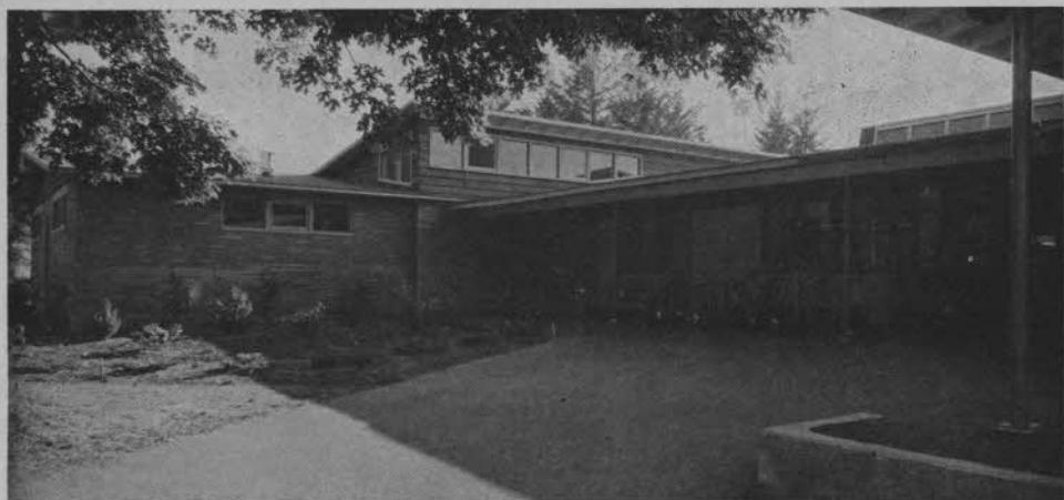
Attractive and practical, Glendoveer's clubhouse handles unusually heavy traffic.