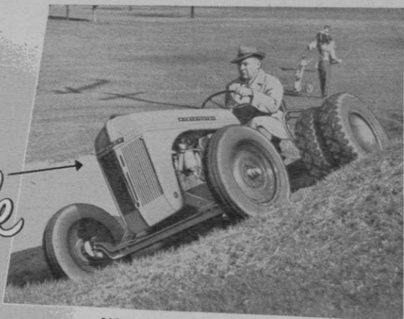
Worthington Model G Tractor