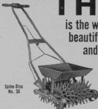
Spike-Disc No. 30

Available with two handles for two man operation - No. 32