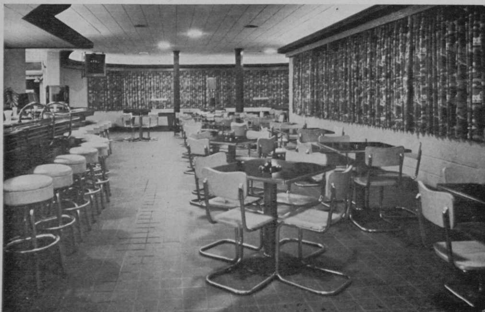
The new grill at Pontiac (Mich.) CC provides the semi-public course player in the community with a facility usually enjoyed only by private club members. The drape-covered windows overlook the practice putting green.

Golf league play was organized along the lines of bowling leagues. In the summers there are five evenings of twilight