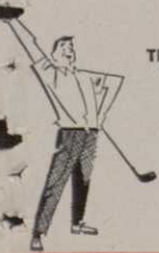
That famous Wilson "click" that says "far and sure"