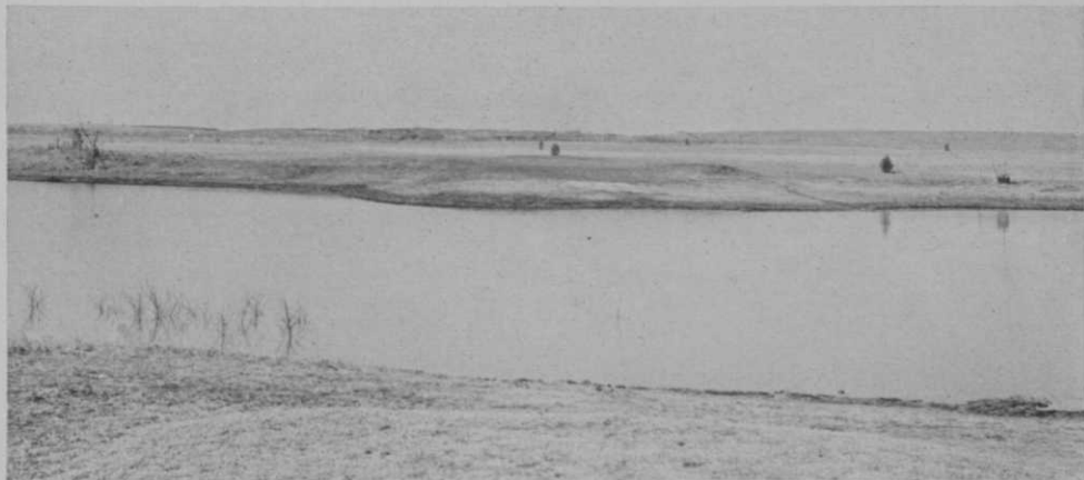
This water hole (the 6th) at Pauls Valley, Okla., is not to be confused with a waterhole at Saucon Valley or Pine Valley, but what do you expect when a 3,077 yd. 9-hole bent green tee course is built for $6500 to supply a lot of pleasant golf, some fishing and prevent airport erosion in a town of 7000?

"The total length of the course is 3,077 yds. Par 35. Four of the holes are dog-legs."