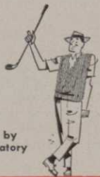
Performance proved by famous players, laboratory and field tests

Wilson Sporting Goods Co. G.D.-4 2037 N. Campbell Ave., Chicago 47, Ill.