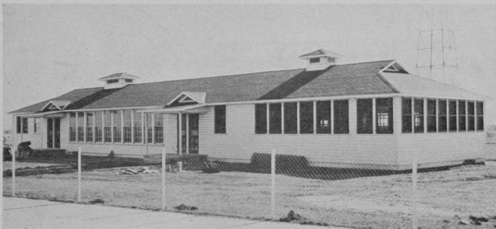
This clubhouse at Pauls Valley combines attractive, neat facilities for the golfers and an airport administration building. The building was remodelled and finished from a gift from Army Surplus.