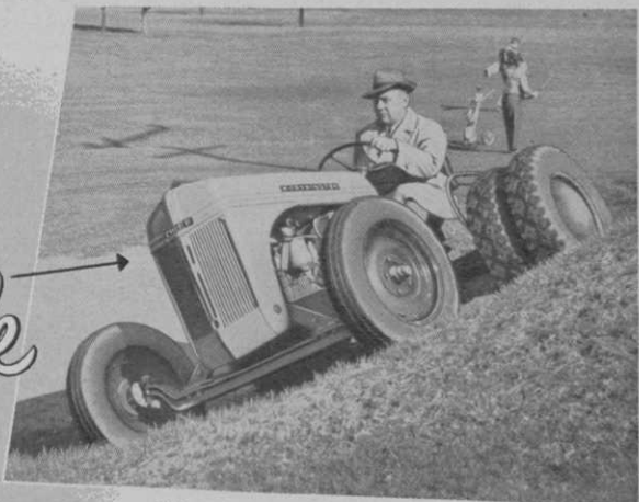
Worthington Model G Tractor