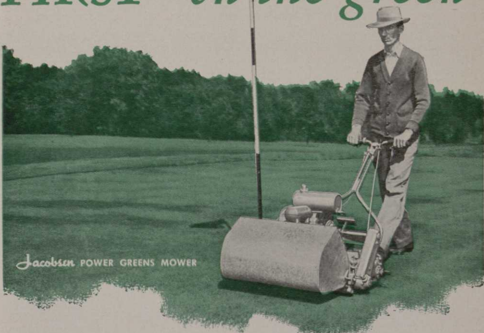
Jacobsen POWER GREENS MOWER