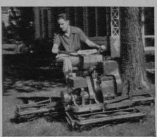
TORO PROFESSIONAL. Cuts 15 to 20 acres per day with 76" swath. "Out-in-front" reel cuts close. Forward and reverse transmission. 7½ h.p. engine.