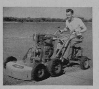
WHIRLWIND GRASS KING. High-capacity 31-inch rotary-scythe mower...cuts fine lawn or heavily weeded areas with equal ease...up to 6 acres a day.

Whether you're looking for a greensmower or an all-purpose tractor, Toro has what you need—and it's built to last! See your nearby Toro distributor today for the machine designed to do the job right .