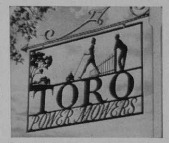
SIGN OF SERVICE... Toro nationwide facilities give you fast help. For more facts, write: Toro Mfg. Corporation, 3022 A Snelling Avenue, Minneapolis 6, Minn.