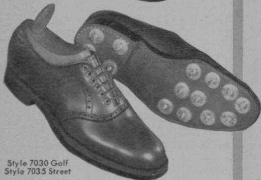
Style 7030 Golf Style 7035 Street

Leading pros sell Foot-Joys for profit for the very same reason that leading pros wear them. Foot-Joys are America's finest golf shoes.