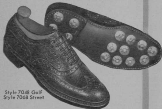
Style 7048 Golf Style 7068 Street