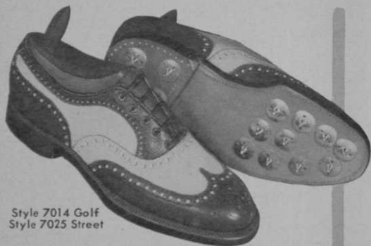
Style 7014 Golf Style 7025 Street