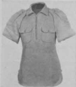
Style: St. Andrews

No. 265. St. Andrews. Finest quality 100% wool knit all purpose Sportsman's shirt with Special Felted Finish for extra wear. Long sleeve with tailored cuff. Special feature "SCOGGINS" under-arm action panel for free-swinging comfort. Specially constructed zipper with no exposed metal parts to catch on bare chest. Extra long 10" zipper front for easy pull-on and pull-off. Two tailored breast pockets with button flaps. Taped shoulder seams to prevent sag at vital points. All seams sewn with Lock Stitch for extra strength. Regular shirt-tail bottom for wear inside slacks.